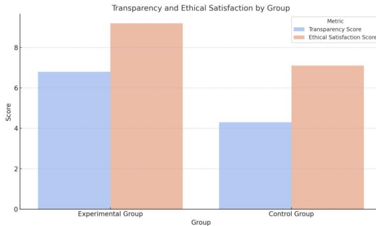
Figure 2: Transparency and Ethical Satisfaction by Group

Figure 2 visually demonstrates the significant advantage of the experimental group with embedded Value Sensitive Design (VSD) in terms of tool transparency and ethical satisfaction scores, compared to the control group. This design philosophy significantly enhances the user experience.”